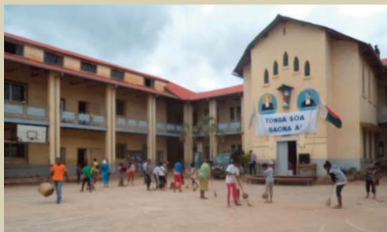
The 2016 MLY national camp

on the promotion of faith, service and community. Formation, community service, prayers and much more was on the agenda at this year's national camp. It is worth mentioning that the MLY national camp has always been a time to show solidarity with the most disadvantaged through social action: this is why the camp is conducted during Lent. The community service was focused on the renovation of the Saint Joseph School in order to offer a healthy and appropriate environment to those who are attending the institution.