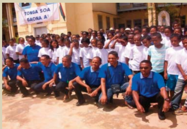
The 2016 MLY national camp

In the primary schools, children can choose to participate in a movement called Lasallian Missionary Children. This movement, which has been active for fifteen years, organizes activities (prayers, gatherings, outings, camps) adapted to its members which introduces them to the Lasallian values. When they graduate to high school, these children participate in the Young Lasallians group, whose activities are based around the three pillars of faith, service and community.